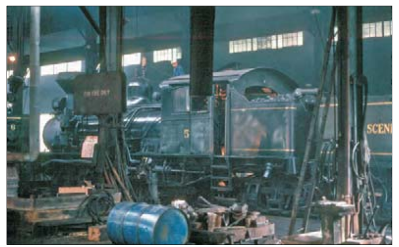
Shay 5 under overhaul in the old Cass Shop.

Countering the addition of the Climax was a significant roster loss. After the 1970 season, Shay 7 was found to require replacement of the first boiler course. A new section of boiler shell was procured which proved to be unacceptable. Then another attempt at fabrication by a different vendor was also rejected. The Shay has sat on the dead line ever since.