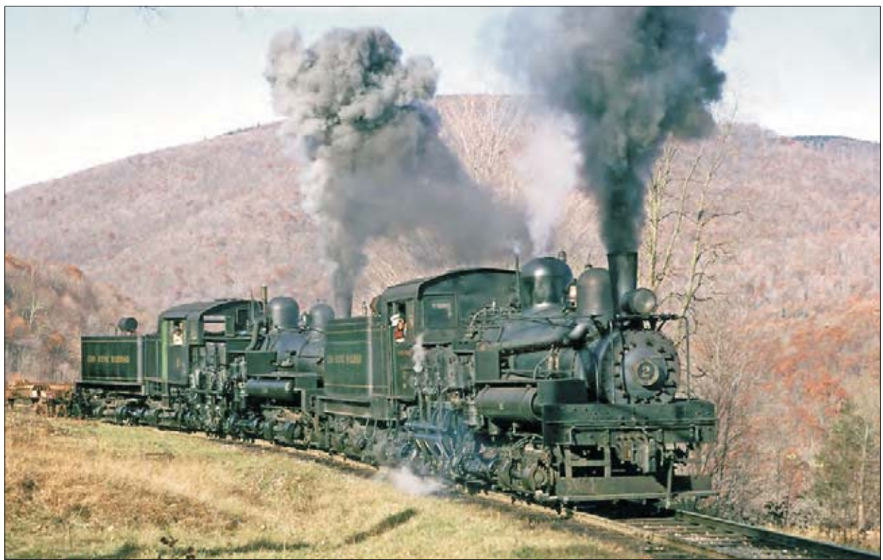
A November, 1973 charter run found Shays 2 and 3 performing on the S-Curve below Whittaker, hauling ex-Meadow River steel skeleton log cars. Shay 2 was still a "stock" PC-13, having a straight stack and a bald smokebox front, its appearance quite different from today.