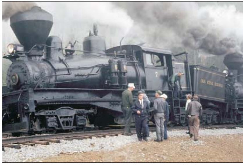
Shay 7 derailed at Bald Knob during Railfan Weekend 1969.

The 1968 season was the kickoff of "Trips to the Top," with the completion of the track rebuild from Whittaker to Bald Knob. Shay 7, the lead engine of a doubleheader with Shay 4, caused some excitement on the rebuilt line by derailing just below the summit at Bald Knob during Railfan Weekend 1969. The actual derailment was witnessed by very few as the large crowd was mostly in photo lines at the top of the hill, unable to tell what had happened because of