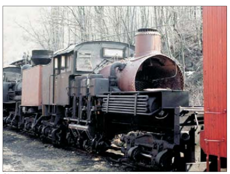
Shay No. 7 on the Cass dead line in 1971.

In May, thanks to the work of the Cass Shop, both locomotives looked brand new. Two months later, the old (1922) Cass Shop burned to the ground with Shay 3 and Climax 9 inside. The No. 3 was pulled out in a daring move by the Cass crew using another locomotive. Otherwise, all anyone could do was watch