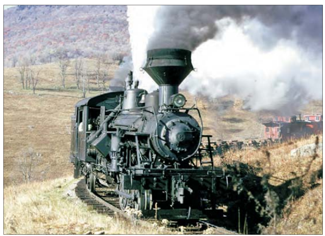
Heisler 6 was also used on the 1973 charter shown on the previous page. The Radley & Hunter stack worn on the Meadow River was changed for a standard Cass diamond in 1970.