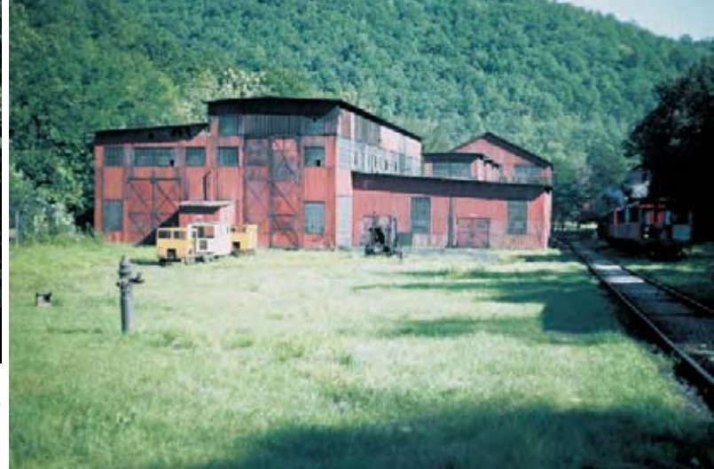
The old shop from the west: tall doors mark the locomotive bays. The highest pair were made to clear a skidder superstructure. The single story portion is the machine shop.