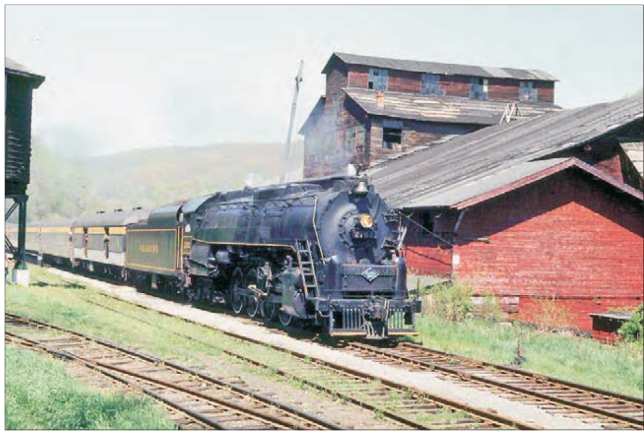
A southbound Greenbrier Scenic Railroad excursion passes the Cass sawmill and water tank in 1971. On one such trip, a tender wheel derailed as the crew attempted to back in and take water. In years past, there had been a water column at this location, serving the C&O main track; its concrete base pad is visible next to the tender.